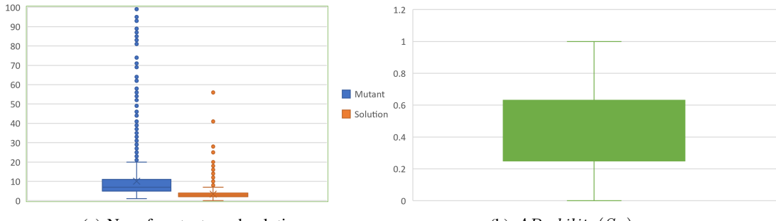
(a) No. of mutants and solutions